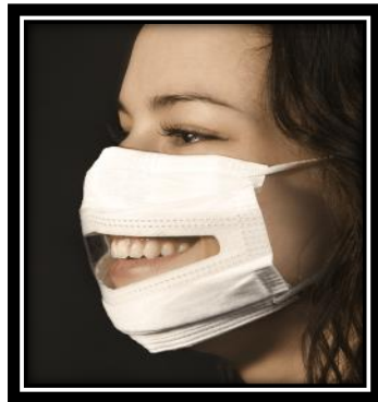
Safe 'N Clear Mask www.safenclear.com/clearmask/