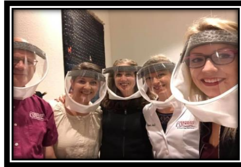
Rapid Response PPE www.rapidresponseppe.com/