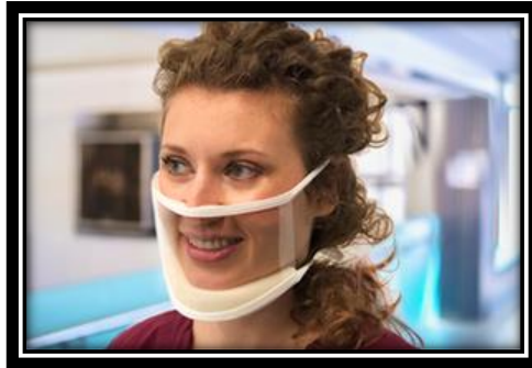
The Clear Mask www.theclearmask.com/