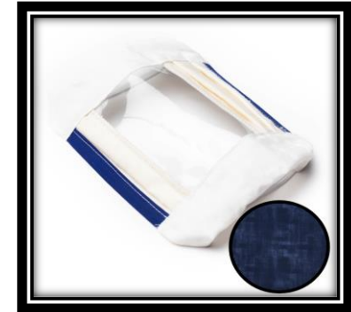
ADCO Communicator Window Mask www.adcohearing.com/