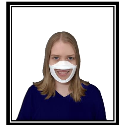
Face View Mask www.faceviewmask.com/