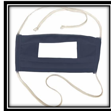
The Hearing Spot www.thehearingspot.com